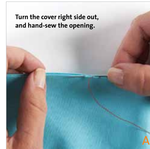
Turn the cover right side out, and hand-sew the opening.

3 SEW THE COVERS TOGETHER. Turn one cover right side out and place inside the other cover, so the covers are right sides together. Align and pin the lower edges. Sew three-quarters of the way around, leaving a 7-inch to 10-inch opening for turning.