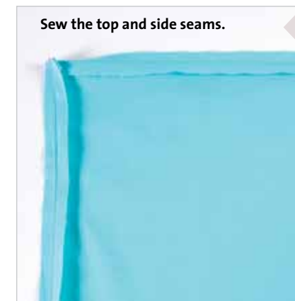
Sew the top and side seams.

A few simple seams make these stylish and practical covers. Since the seams are enclosed, they are left unfinished. All seam allowances are 1/2 inch wide.