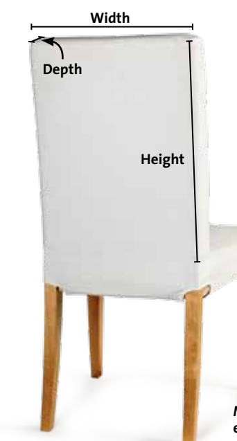
Measure your chair and add ease and seam allowances.