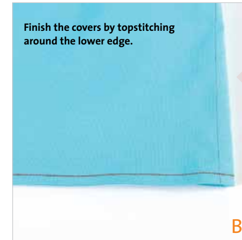
Finish the covers by topstitching around the lower edge.

4 THROUGH THE OPENING, TURN THE CHAIR COVER RIGHT SIDE OUT. Press the seam allowances to the inside. Hand-sew the opening closed (A), or topstitch around the lower edge (B). Press all the seams.