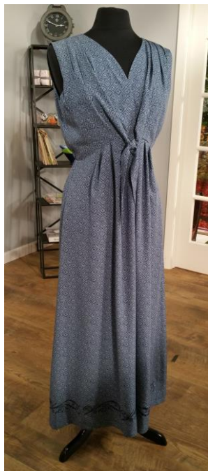
Close-up of dress hem