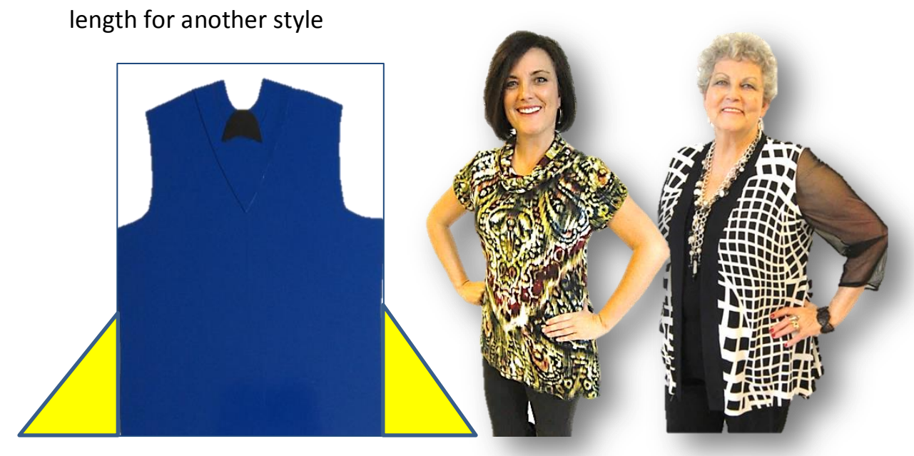
Add rectangle to front and back for side tie

Add right angles to front and back for top or vest. Lengthen to tunic